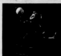
The Walt Disney Company Presents The American Teacher Awards