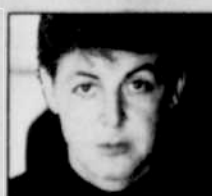
Paul McCartney: Going Home