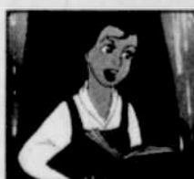
The Making of Disney's "Beauty and the Beast"