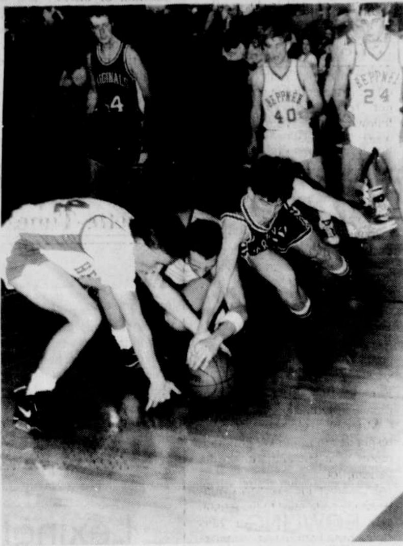
Ione and Heppner players scramble for ball