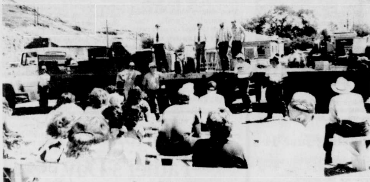
Ione auction in full force