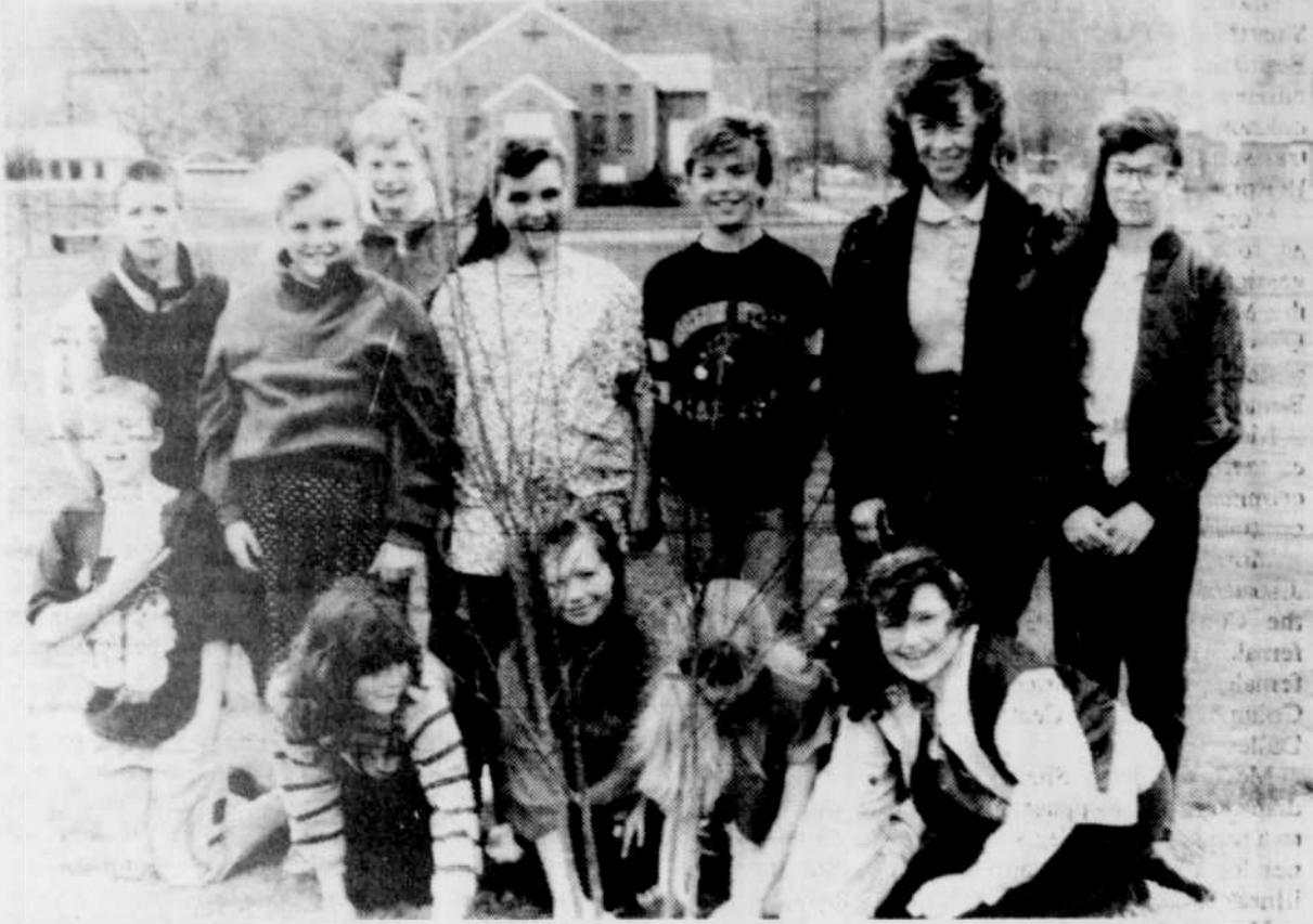
Mrs. Pointers' fifth grade class planted a tree in the lone city park for Arbor Day.

Ione's elementary fifth grade class participated in Arbor Day by planting trees in the lone city park with the assistance of lone city employee Jim Rudisill. All 12 students helped to shovel dirt, pack soil and water the trees in one corner of the lone city park on April 1.