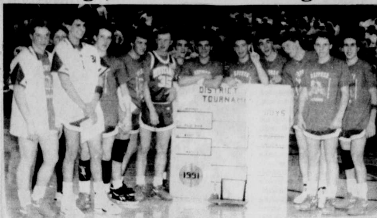
Heppner Mustangs accept bracket board and first place trophy as winners of the District 7 Tournament in Pendleton.

The Heppner Mustangs and Fillies both advanced to the Regional Tournament Friday and Saturday, March 1 and 2 held at the Quinn Coliseum in LaGrande.