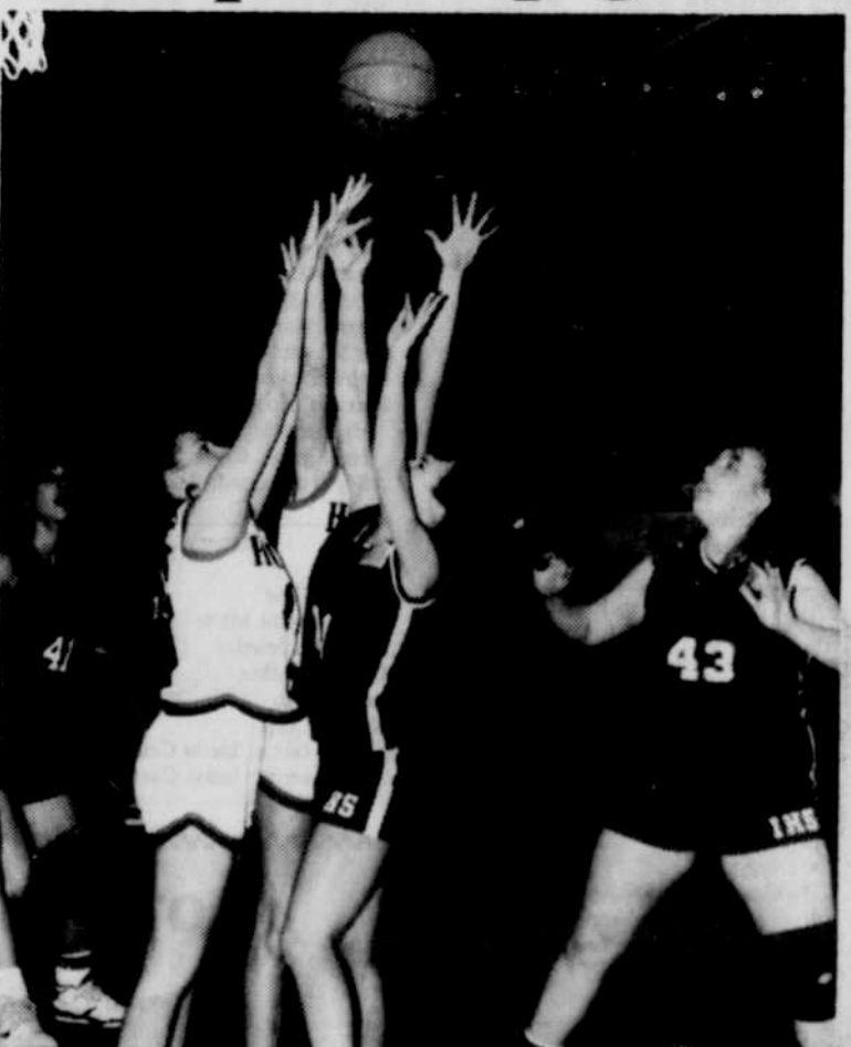
Ione girls fight for rebound. He also noted that a lot of the girls improved dramatically during the season, giving him high hopes for next season.