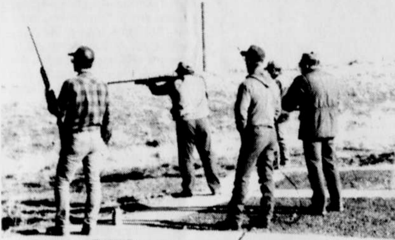
Morrow County Gun Club members practice shooting.

Dressed to kill (clay targets that is), warmly clad Morrow County Gun Club members are braving the January weather for participation in an eight-week series of telephonic shoots.