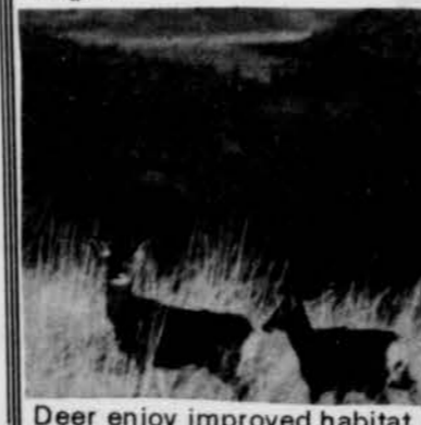
Deer enjoy improved habitat.

In general, the future funding of cooperative habitat programs looks good. This is highly beneficial as the majority of the land base in the Heppner District is private. With continued landowner cooperation, effective management and a little help from mother nature, the future of our valuable wildlife resource looks bright.