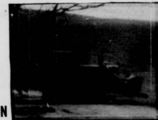
(drainage is our specialty)

DIVERSION DITCHES LAND LEVELING ROAD CONSTRUCTION