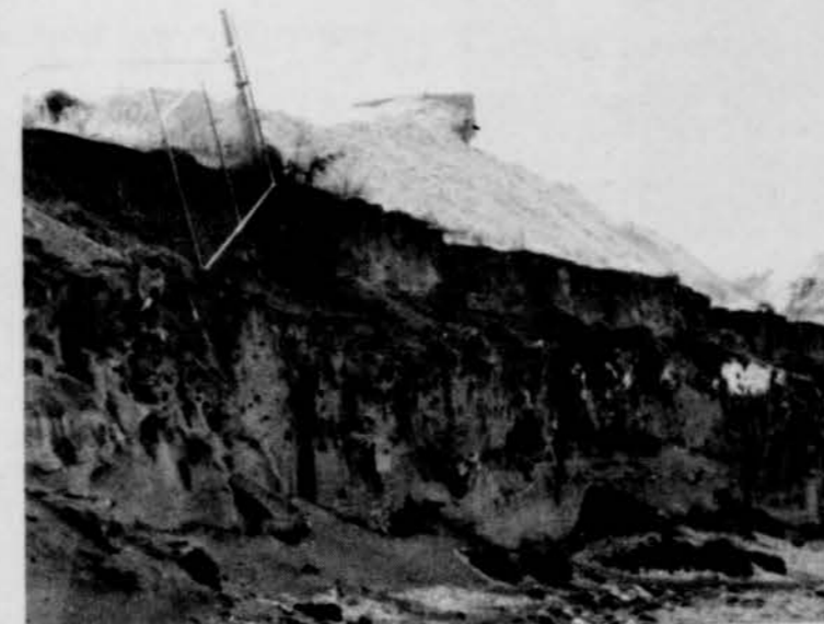
RC&D funding was received to help stabilize streambank erosion at the Port of Morrow.

District staff has been busy and looks forward to the coming year with enthusiasm and also some concern considering Measure 5.