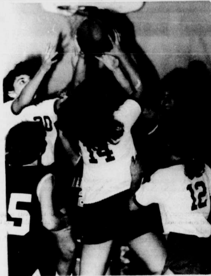
Ione Middle School girls grab rebound in Arlington win.