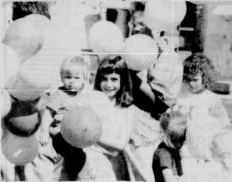
Day care kids celebrate with picnic.

On August 30 the staff and children of Heppner Day Care had an end-of-summer vacation picnic at Hager Park.