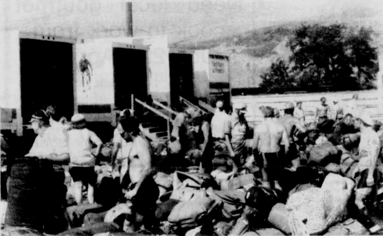
Bicyclists look through mountains of bags at fairgrounds.

It was a whirlwind weekend romance—but what a romance it was—when nearly two thousand bicyclists swept into Heppner Sept. 9 on the first leg of their journey with Cycle III, a bicycle tour across Oregon. And "seldom was heard a discouraging word," to quote an old cowboy song, from either bicyclists or townspeople.