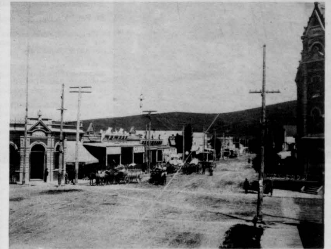
Heppner's early days. Looking down mainstreet date unknown.

These local businesses say Welcome Bicyclists