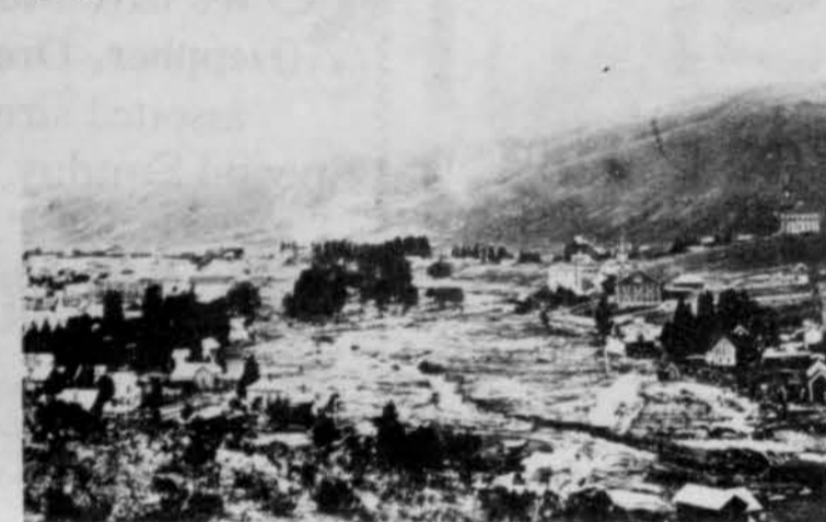
Devastation of 1903 Heppner flood

Most of the furniture in the Clerk's office is believed to be what is left of the original furniture.