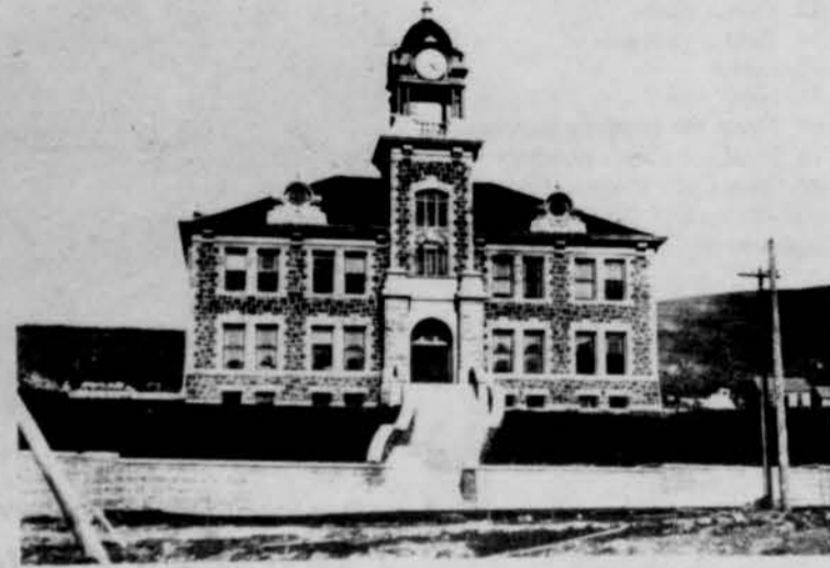
Morrow County Courthouse, shortly after completion in 1903.

The thick walls in the assessor's office once surrounded the county jail. The old jail is now used as the appraiser's office and a computer room.