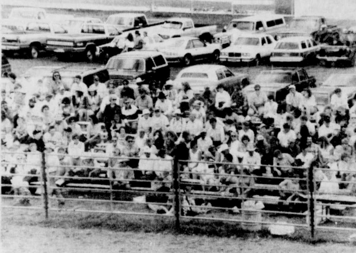
A large crowd enjoys Saturday's rodeo

A record crowd of around 2,000 people attended the Professional Rodeo Cowboys Association rodeo held Saturday, Aug. 18 in Heppner. The rodeo, held under clear skies and beautiful weather and with a refurbished rodeo arena, was the first PRCA rodeo held in Heppner since 1977.