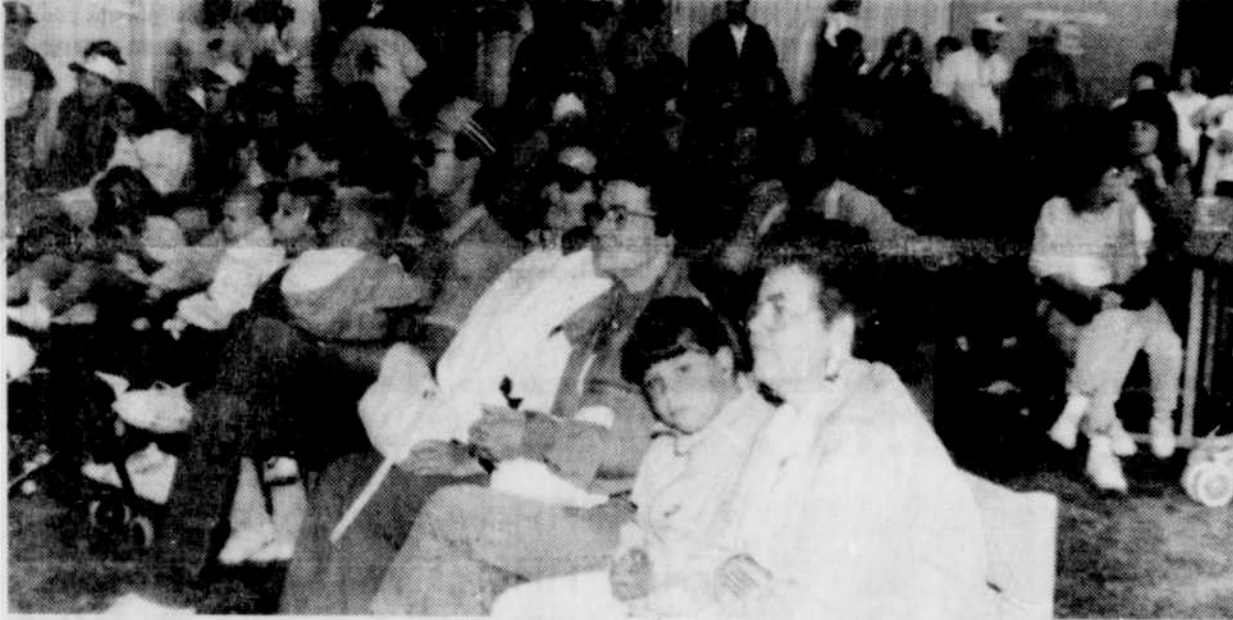
Fairgoers enjoy talent contest

Total gate receipts for the 1990 Morrow County Fair and Rodeo were up $3,000 over last year, from $9,500 in 1989 to $12,595, according to fair officials.