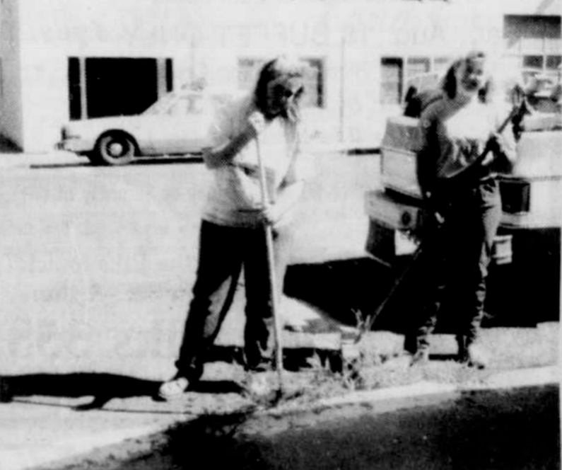
The Morrow Soil & Water Conservation District crew has been working around town getting ready for fair and rodeo and Cycle Oregon III.