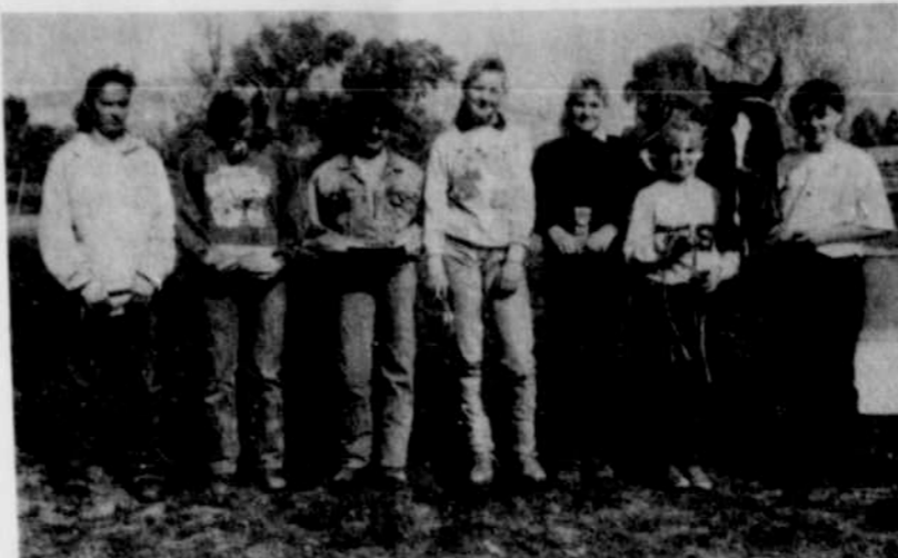
11-13 year olds

For more information call 676-5037 or 676-5878. You don't have to be a member to participate, said a Wrangler spokesperson.