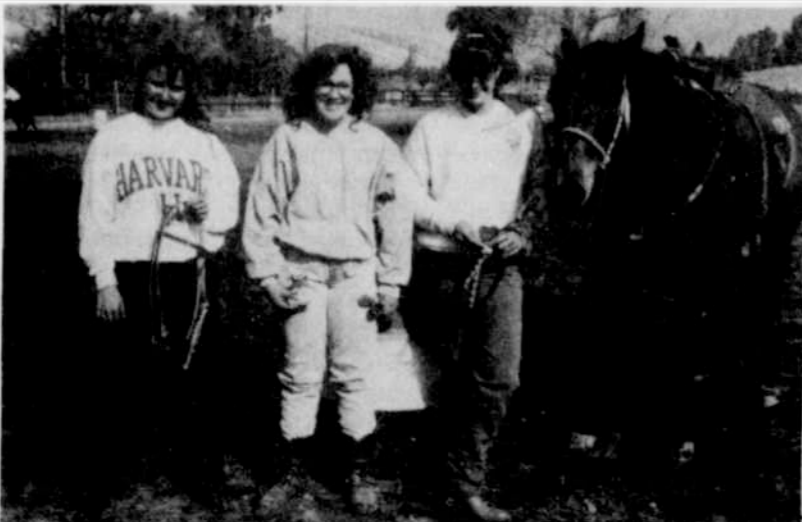
11-13 year olds