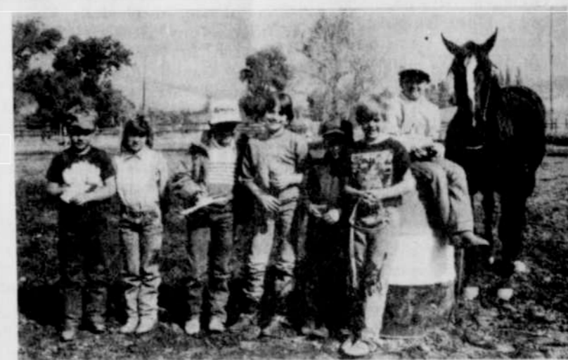
6-7 year olds