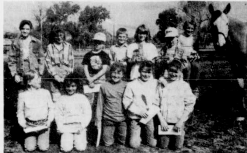
8-10 year olds