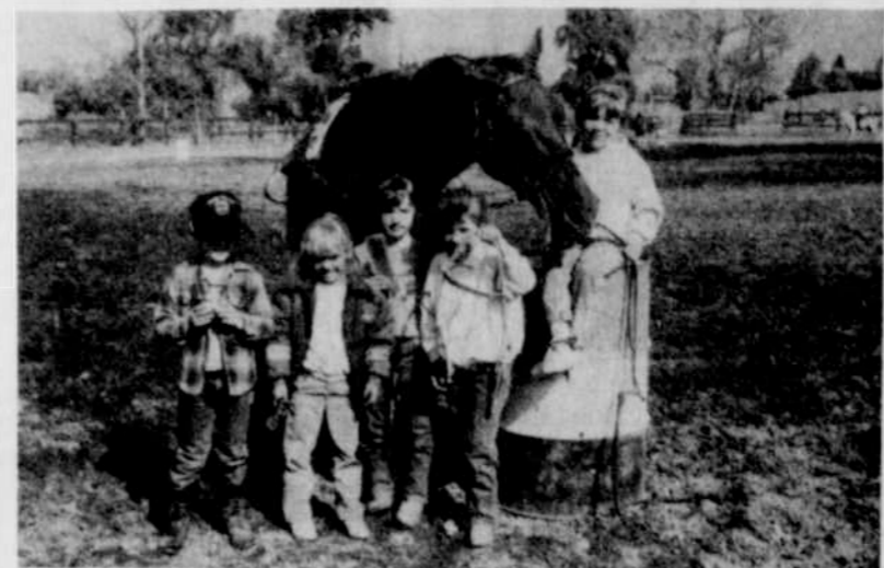
5 and under