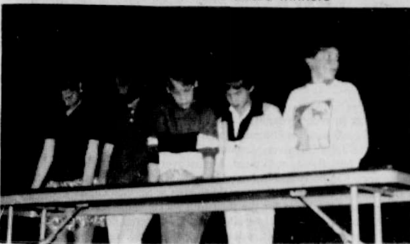
Sixth grade Presidential Fitness Award winners

The Academic Awards Assembly was held Thursday, May 31 for Heppner Elementary and Junior High Schools. Students in grades 2-8 were recognized for participation in special programs, exceptional effort, academic excellence, and performance in academic skills contests. Refreshments were provided by the Parents' club following the assembly.