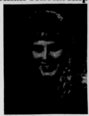
renewable, will be honored Wednesday, August 8, at a banquet at Portland's Hilton Hotel. The Hon. Mark O. Hatfield, U.S. Senator from Oregon will be featured speaker.