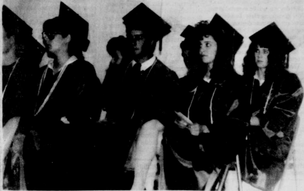
Iones graduating seniors await their diplomas.