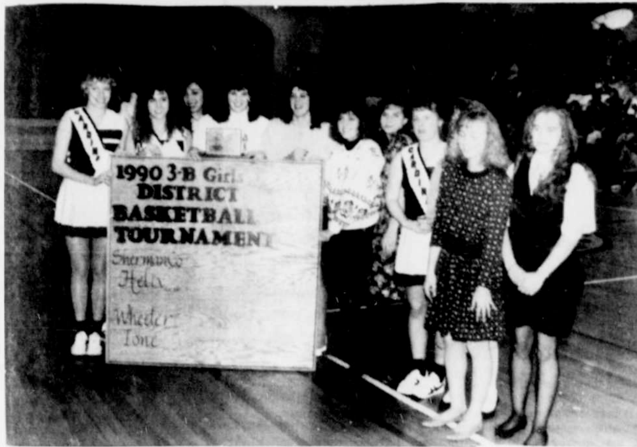
Ione girls show off bracket board they won in taking first at District.

The Ione girls basketball team will play in the Class B State Tournament opening game against Jordan Valley on Wednesday, Feb. 28 at 1:30 p.m. at the Baker High School