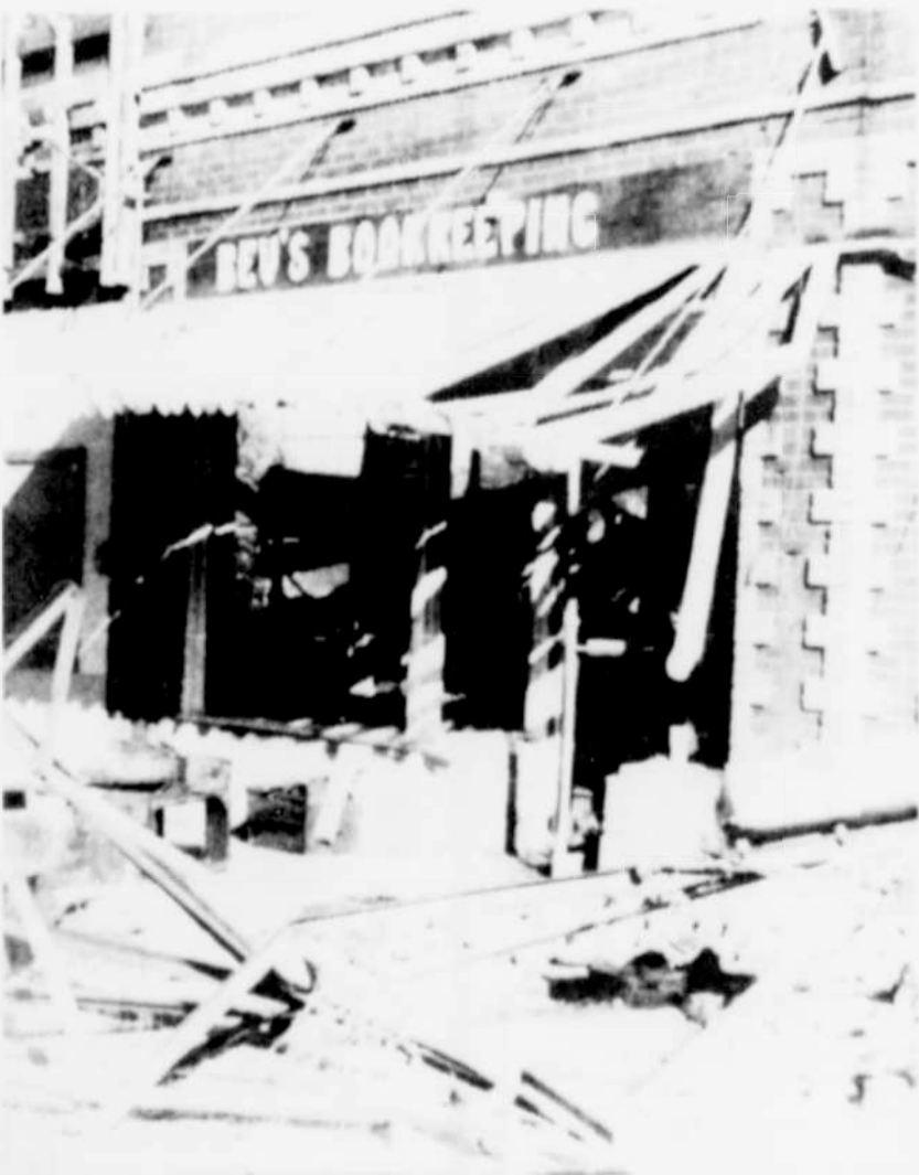
In the aftermath of the fire Bev's Bookkeeping sign still stands. More fire pictures on page 6.

The Heppner Chamber of Commerce office, located at Bev's Bookkeeping has relocated its office to Heppner TV.