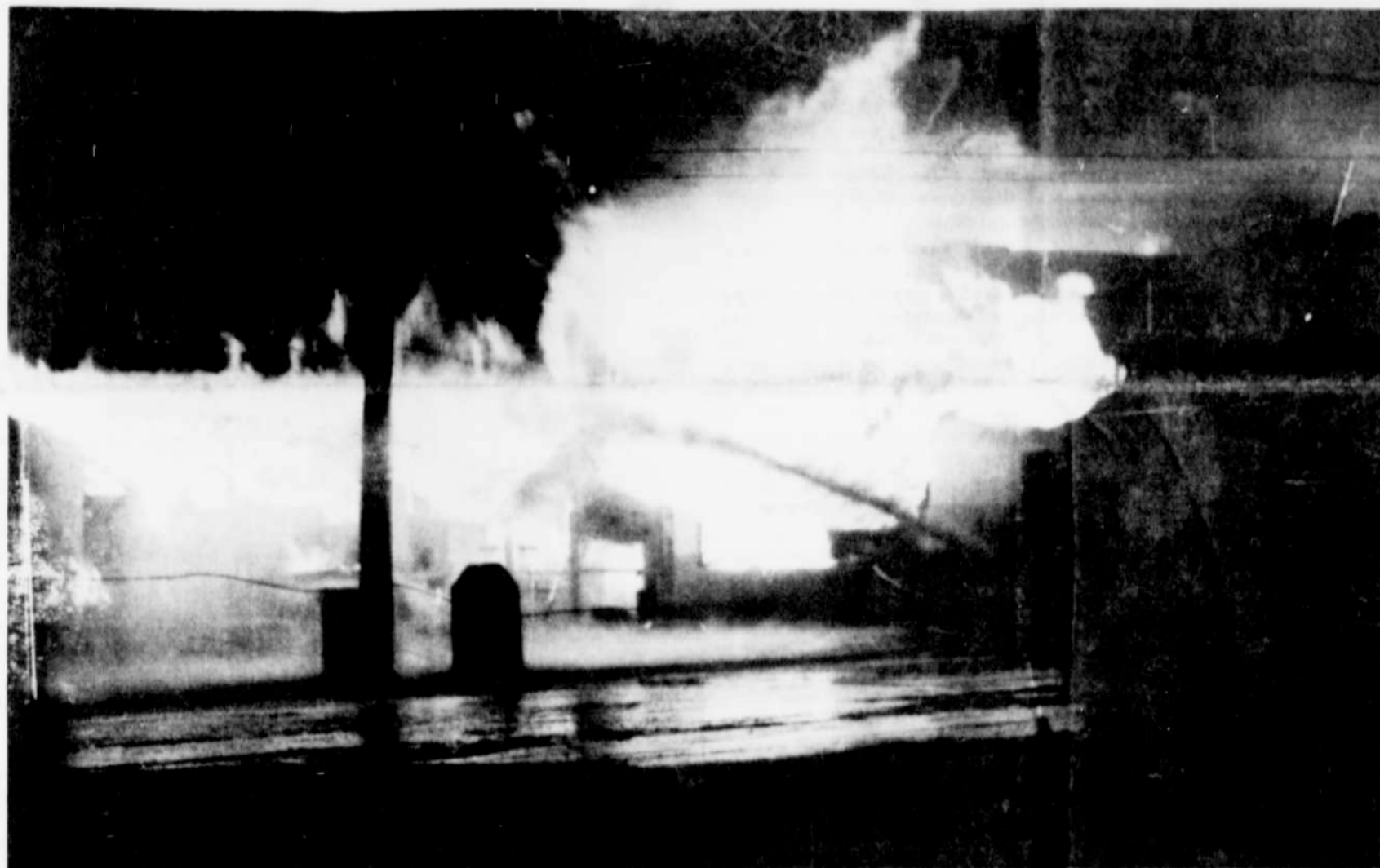
Central Market in full flames in Saturday's early morning fire that started at the Wagon Wheel Restaurant.