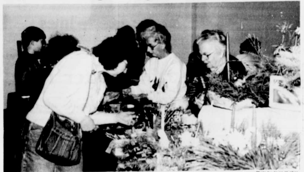
Visitors to the artifactory craft fair Dec. 2 make their own Christmas wreaths with assistance from the Garden club members.