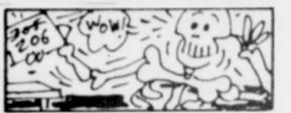
A human being is born with 305 bones, but during childhood a number of them fuse, so an adult has only about 206.