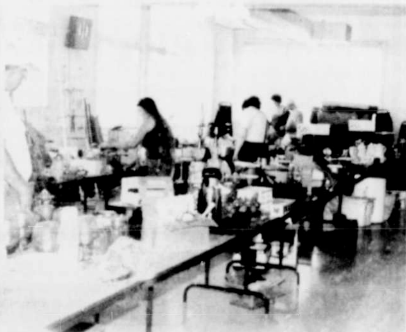
Many people were on hand last Friday and Saturday for the Senior Center rummage sale.