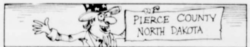
The geographic center of the North American continent is in Pierce County, North Dakota, six miles west of Balta.

So as a new school year is about to begin I am eager but also apprehensive. I want the year to be a positive one with great things happening in our district. I want Morrow County to regain its reputation as one of the better districts in the state. I want students leaving our schools to go to college or to enter the work force prepared to compete well with other students. I am fearful that too many of us can not, or will not, put the past behind us and begin anew to accomplish this. This is why I am apprehensive. I, for one will put the past in perspective, learn by it and try to make the future better. That is why I am eager.