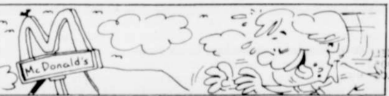
The largest restaurant chain is McDonald's Corp. Beginning as a hamburger stand in 1955, it's sales today surpass $11 billion.