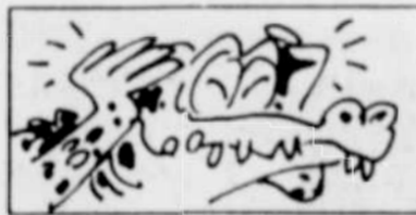
Alligators can close their ears just as camels can close their noses.