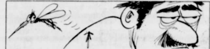
The average time lapse between a mosquito bite and mosquito itch is about three minutes.

Flight B: low gross-Ron Bowman; low net-Earl Norris; long drive-Ron Bowman; K.P.-Ron Bowman.