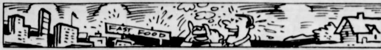
On any given day in America, roughly 20 million people buy take out food.

(Connect the dots to find this week's T-Bill Money Market rate.)