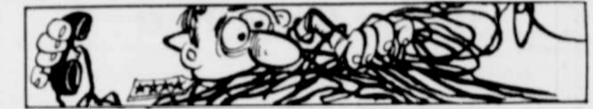
The Pentagon has 68,000 miles of telephone lines.

Thought for the week: "Life is either a daring adventure or nothing"...Helen Keller.