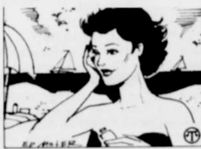
Be sure to apply sunscreens where reflected light can reach.

Remember these tips to help keep your skin beautifully protected.