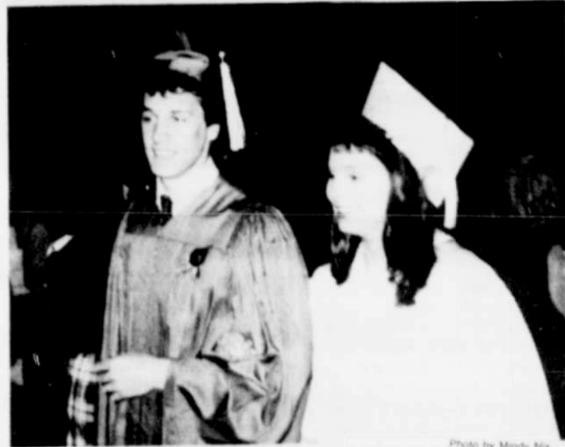
RHS graduates march down the aisle after graduating Friday night in Boardman.