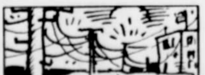
The Pentagon has 68,000 miles of telephone lines.