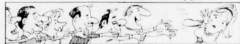
There are about 20 million more men in the world than there are women.

Court Club where they spent the night playing rackets, swimming, etc. The members of the class all received door prizes ranging from cash prizes to ice chests. The class had a great time at the drug/alcohol free party. Operation Graduation was designed to keep the graduates from drinking and out of trouble following graduation.