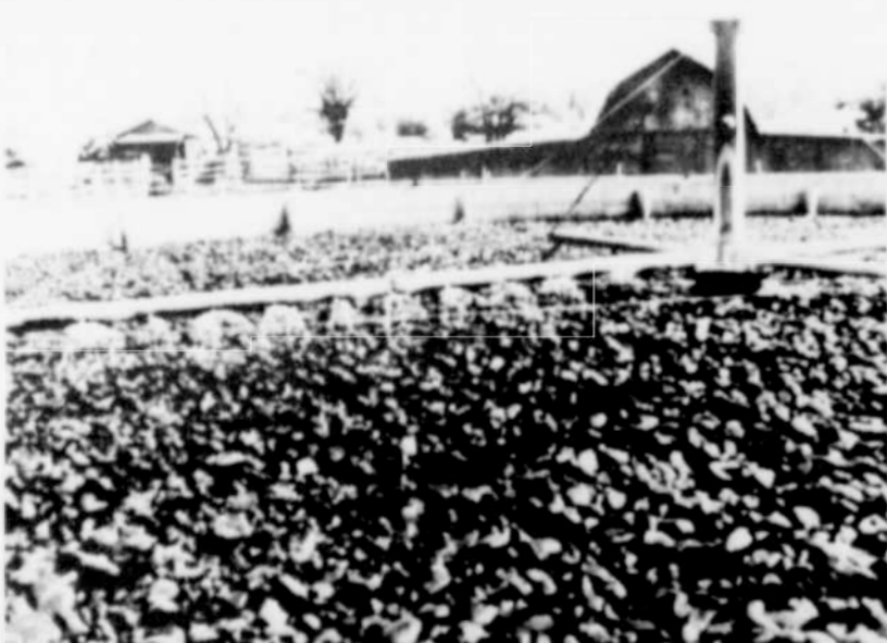
Sprinkling beds at the sewer plant are not working efficiently.

treated water from the treatment plant into Willow Creek during lower stream flows this summer, for fear of harming plants and other aquatic wildlife downstream from the plant.