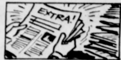
Almost half the newspapers in the world are published in the U.S. and Canada.