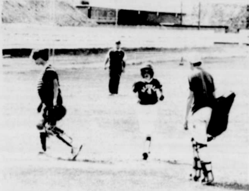
Jerid Wicklund crosses home plate for run against Stanfield.