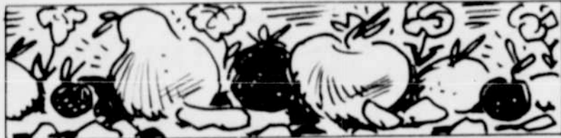
A rose by any other name? Apples, pears, plums, cherries and almonds are all related to the rose.

Ad sponsored by Morrow County Grain Growers