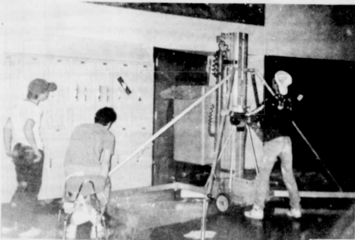
Riverside High School students painted the Commons during spring break. The paint was purchased from Student Council funds.