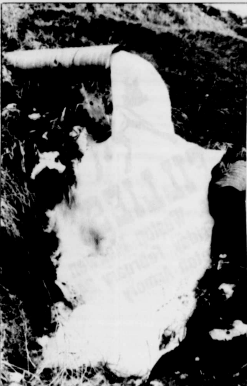
Although weather has been warmer lately, it's still not warm enough to melt this picturesque "ice fall" near the elementary school in Heppner.