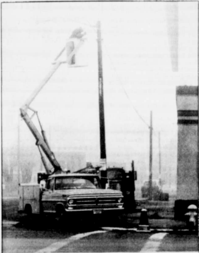
Tom's TV puts up the street lights last Thursday. Columbia Basin also assisted in putting up lights and decorations.