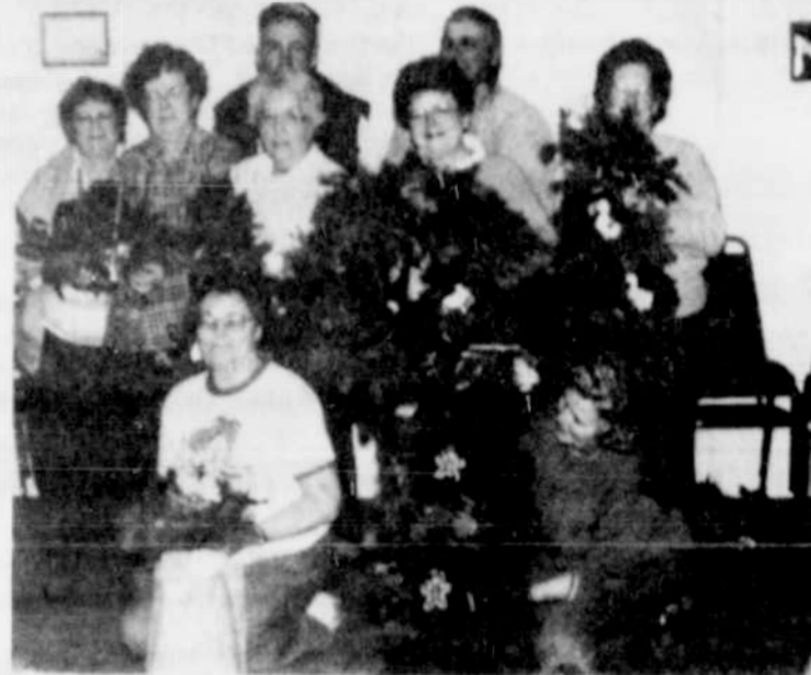
Heppner Garden Club members display some of the greenery that will be for sale at the Artifactory Saturday. Swags, wreaths and centerpieces decorated with holly and hand-painted ornaments will be available.

"I have accepted a position with the Port of Astoria. The opportunity to learn more about deep water port operations and to use the skills I already possess is a temptation that is more than I can resist," says Miller.