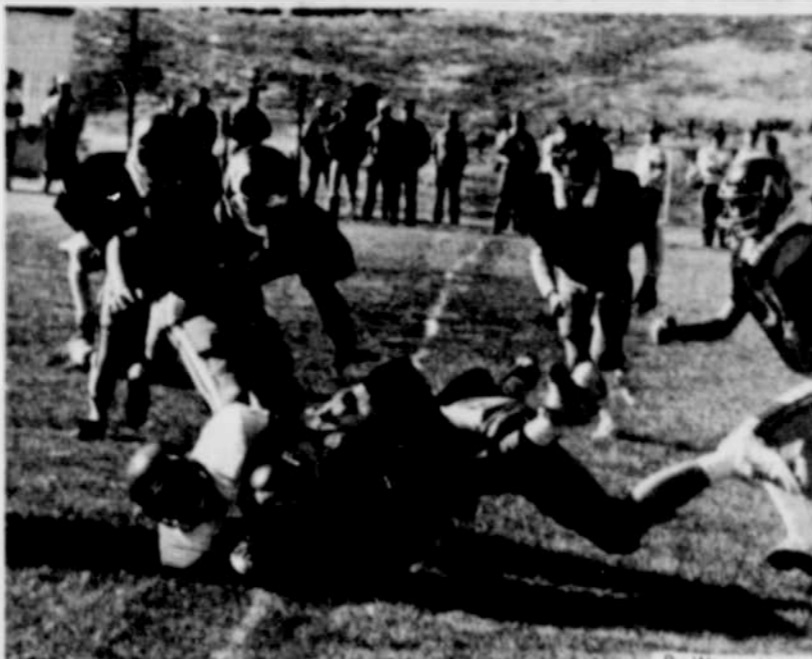
A Cardinal player is surrounded by Wheeler County Falcons in the game against Wheeler. Lone won 28-20.