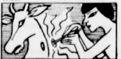
Cattle branding was practiced 4,000 years ago. Old tomb paintings show Egyptians branding their cattle.