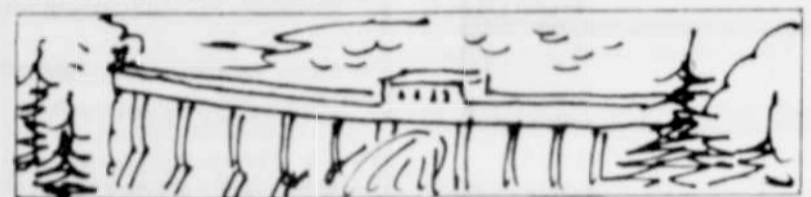
During the construction of the Hoover Dam, concrete had to be poured continually for two years.