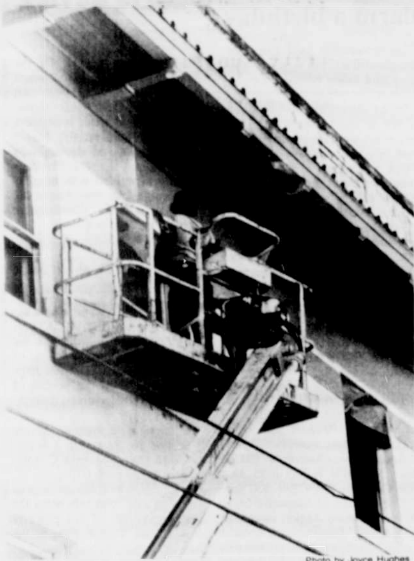
The Heppner hotel project is receiving a new coat of paint this week.