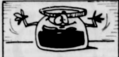
Brown sugar will keep soft if removed from the package and placed in a dry glass jar with a fresh peel of lemon.