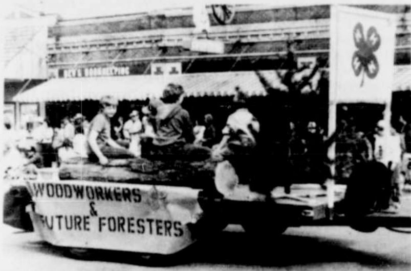
The 4-H Woodworkers and Future Foresters float won first prize in the St. Patrick's Day parade.