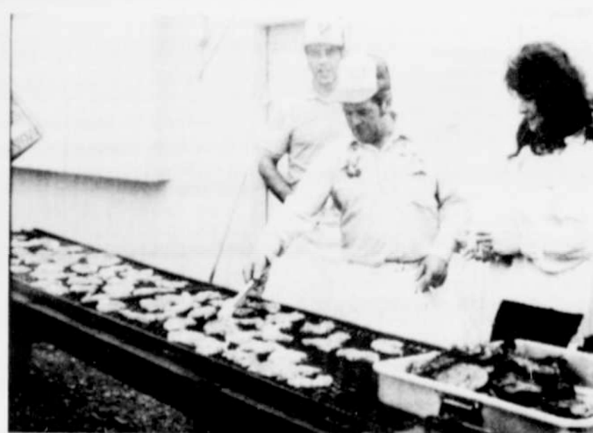
Cooks prepare the lamb barbecue at the fairgrounds Sunday.