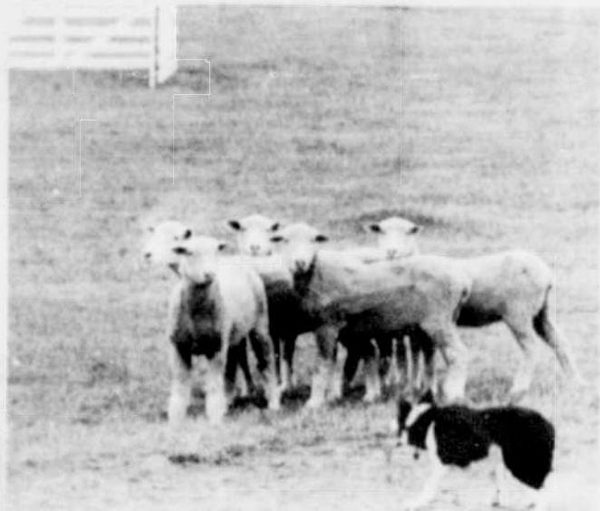
Eyeball to eyeball at the dog trials.