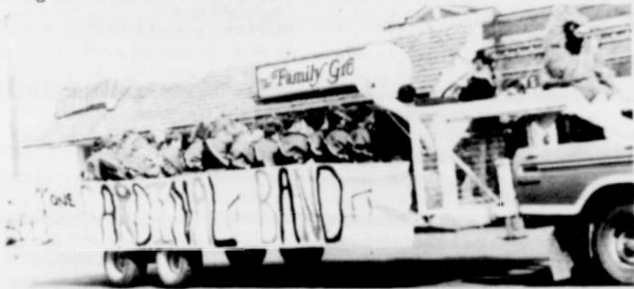
The lone Cardinal Band was a welcome addition to the parade.