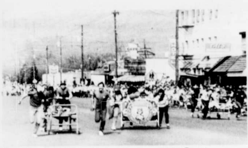
Participants of the bed race charge up Main Street. The winner of the race was D & L Repair. The Heppner Soroptimist won "Best of Show".