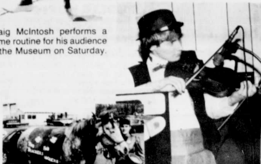
Member of the BMCC "St. Patrick's Day Players" makes music during radio program.