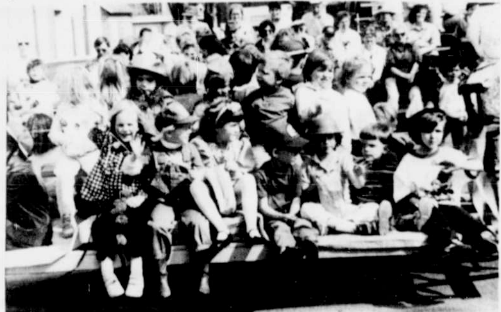
The Heppner Pre-School won second place in the float division. A large number of pre-scholars participated to make this a good entry.