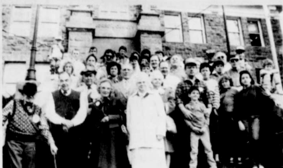
The Farley-Monahan family poses for picture on the Courthouse steps.