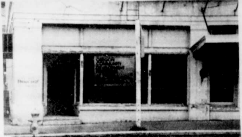
The sign in the window of the Heppner Hotel proclaims that the Oregon Community Development Program is participating in the restoration of the hotel for a senior housing development. They have designated $500,000 to the project.