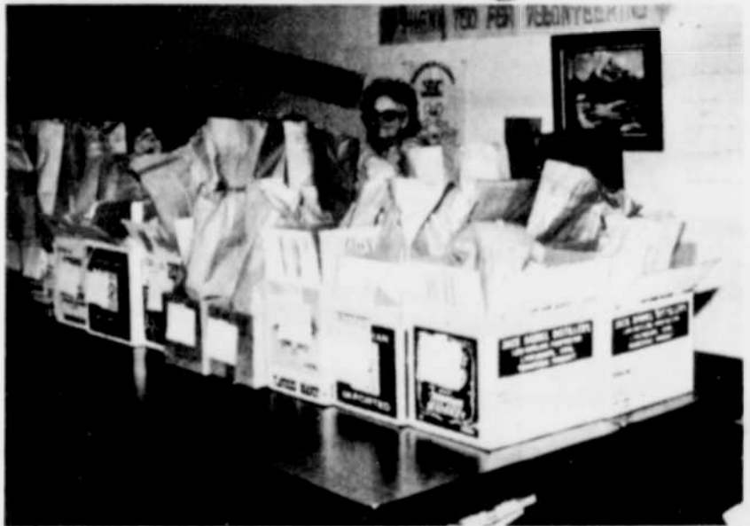
Betty Tanner is shown with some of the boxes that are to be delivered this Christmas by the Neighborhood Center.

The Heppner Neighborhood Center team of about 6 people put together 70 dinner boxes, 70 extra food boxes and toy boxes for 49 children this last week. Court Street Market put together the food boxes for Christmas as did Central Market for Thanksgiving. The center pays for the food and the stores assemble