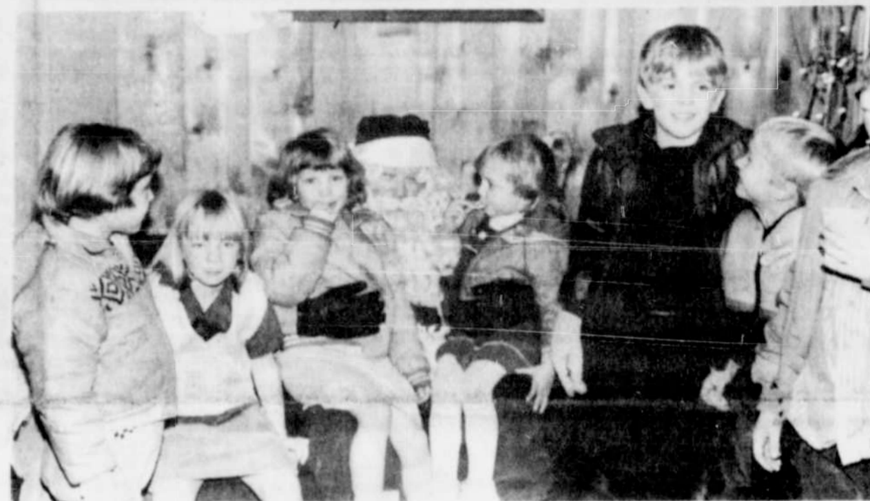
Kids are telling Santa what they would like to see in their stocking at Benjamin Franklin Open House last week.