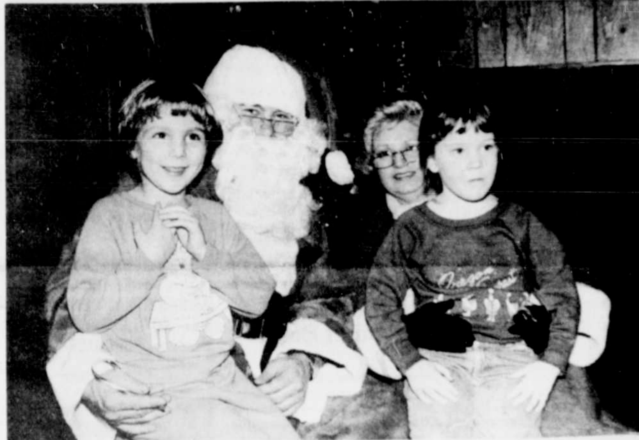
A number of kids had lunch with Mr. and Mrs. Santa on Sunday at the Elks followed by a movie. The chamber put on this program for the children of shoppers, as stores were open for Christmas shoppers from 12-4 p.m.