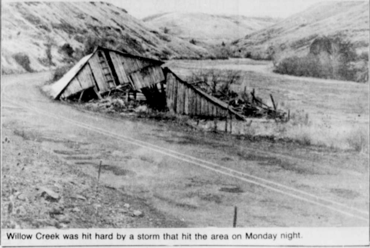
Willow Creek was hit hard by a storm that hit the area on Monday night.

The Oregon State Police-State Highway Division wintertime Road Condition Report telephone hotline is now operating. The Portland hotline number 238-8400, tells travelers about winter road conditions statewide. Callers may select road condition reports for any of eight state regions