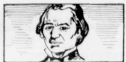
Andrew Johnson was the only ex-President to be elected to the United States Senate.

J.V. First game: Culver 15-3, second game Culver 15-7.