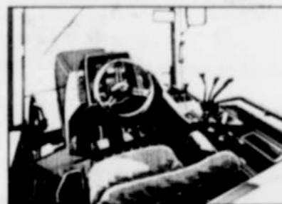
MAGNUM Comfort. A more productive environment.