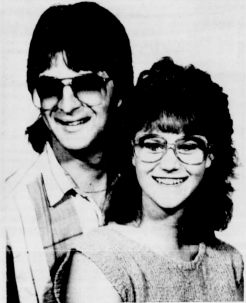
Maasdam — Mitchell

commonly prescribed anti-inflammatory drugs. They also relieve pain at least as well as morphine but without its narcotic and addictive side effects. The drugs may one day be used to treat such diseases as arthritis.